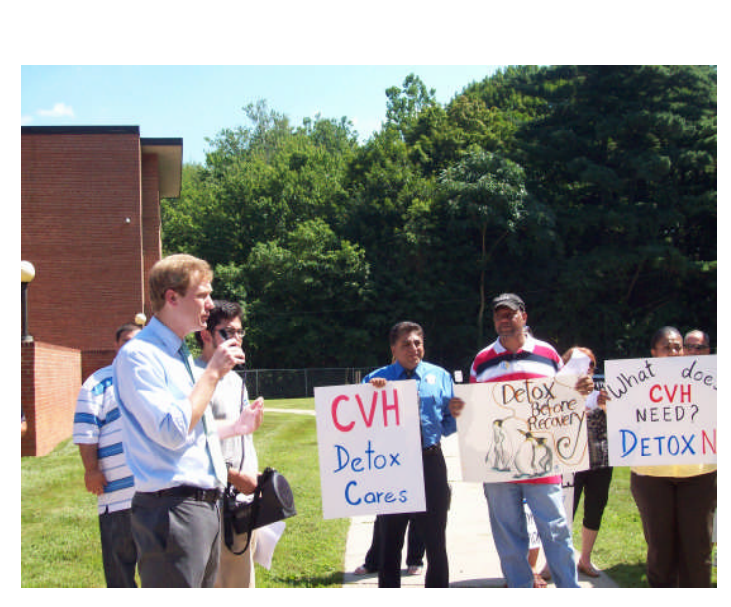
On August 26, Matt spoke at a rally to protest cuts to several state funded mental health and addiction services, including at Blue Hills Substance Abuse Services, where the rally was held. "It's in difficult economic times that we need these services the most," Matt said.