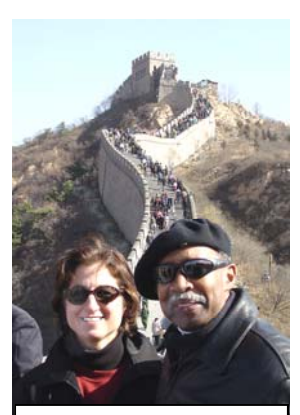
At the Great Wall of China

The purpose of the trip was to observe the Chinese educational system, pro-