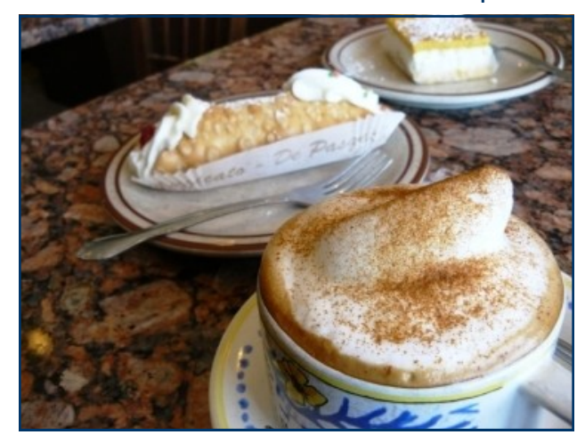
Dessert at Mozzicato De Pasquale's Bakery on Franklin Avenue

The housing market, which had been the bulwark sector of the national economy, entered a recession in 2007, with home prices and housing starts declining substantially across the nation. The retail and office space markets, which had