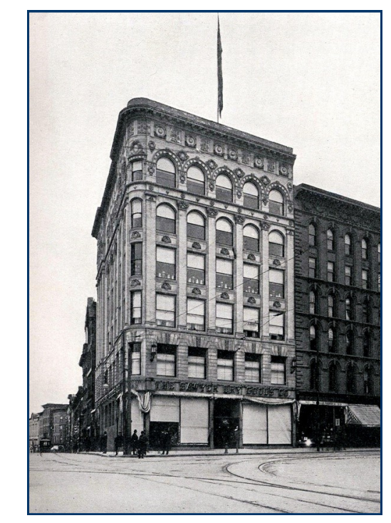
G. Fox and Sage Allen Department Store