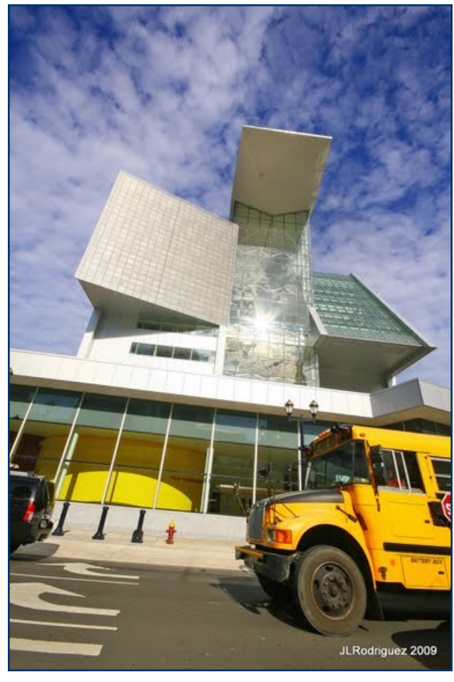
The Connecticut Center for Science and Exploration