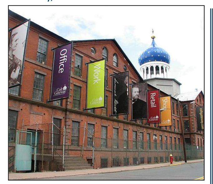
Colt Fire Arms Factory Redevelopment