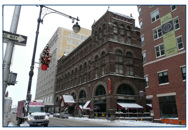
Main Street Corridor