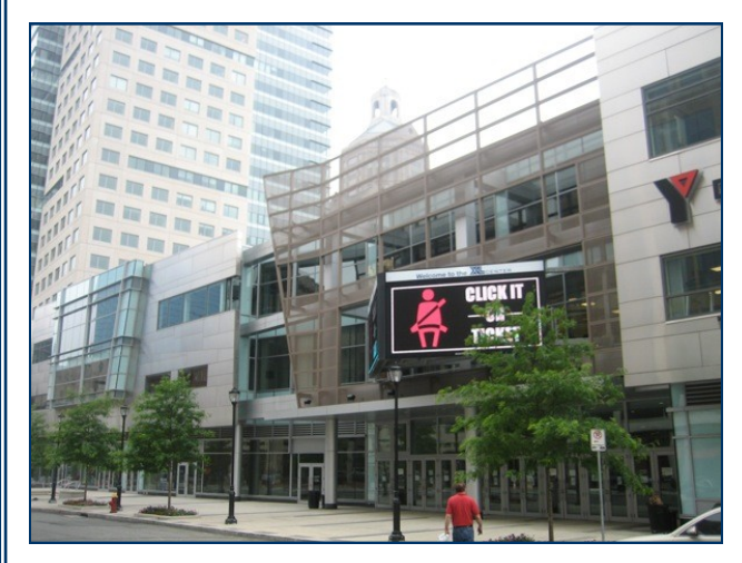
The Hartford Civic Center