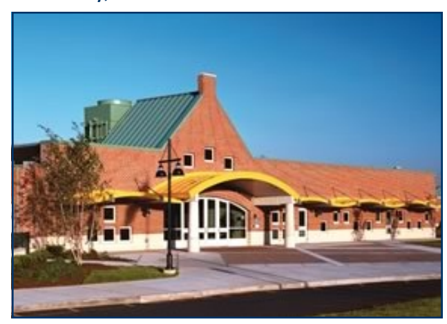
University of Hartford Magnet School