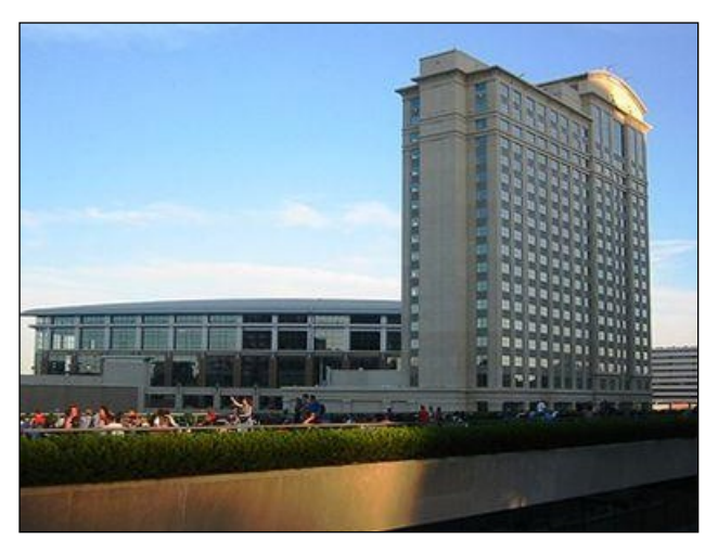
The Marriott Hotel at Adriaen's Landing

work data highlights several important elements of the Hartford economy. First, although Hartford residents are highly dependent upon jobs located within the City itself, businesses located in Hartford are primarily staffed by a workforce that is based in the surrounding suburbs. While 44.5% of workers residing in Hartford remain in the City for employment, only 17.1% of the jobs in the City of Hartford are filled by City residents. According to the 2000 Census, less than 7% of resident Hartford workers traveled beyond Hartford County for employment.