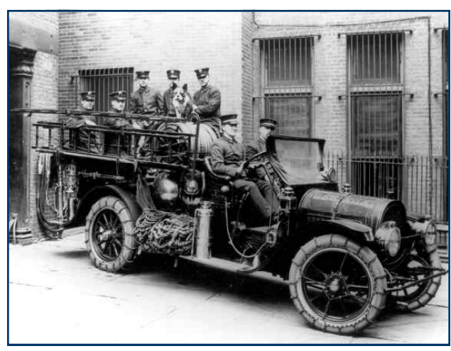
Pope Hartford Automobile

The insurance industry became more formalized over time, and by the early eighteenth century insurance, companies were chartered. The Aetna Insurance Company was incorporated in 1819 and by 1881 was the largest insurance company in the country. Many of the insurance companies in Hartford today were incorporated by the middle of the nineteenth century. Hart-