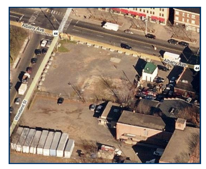
Albany & Woodland Redevelopment Site