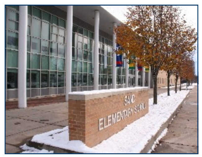
SAND Elementary School

ford soon became known as the Insurance Capital of the World. By 1981, 39 companies had home offices in the Hartford region.