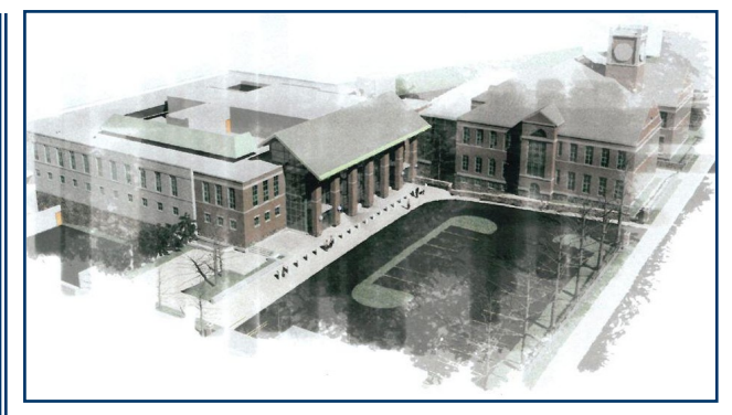
Public Safety Complex