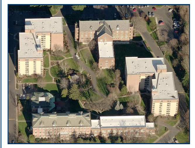
High Density Residential—HDR