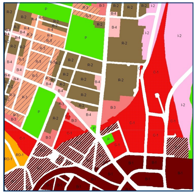
Land Use (top) informs Zoning (bottom)