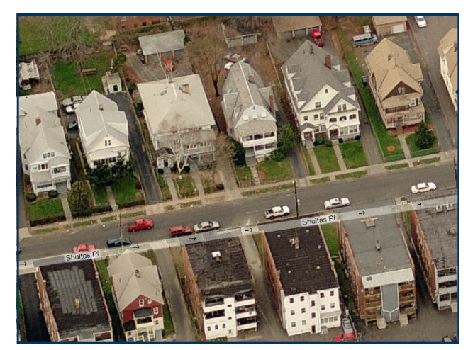
Medium Density Residential—MDR

Conservation & Development Policies Plan illustrates the Land Classifications for Hartford according to the Conservation and Development Policies Plan for Connecticut: 2005-2010.