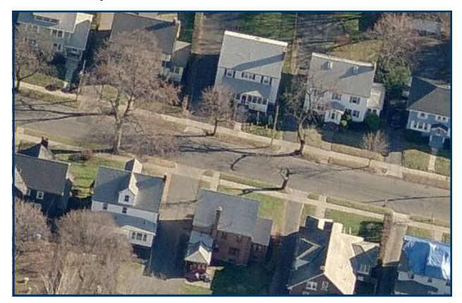
Low Density Residential—LDR