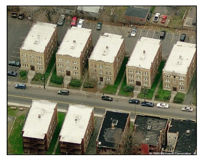
Medium-High Density Residential — MHDR