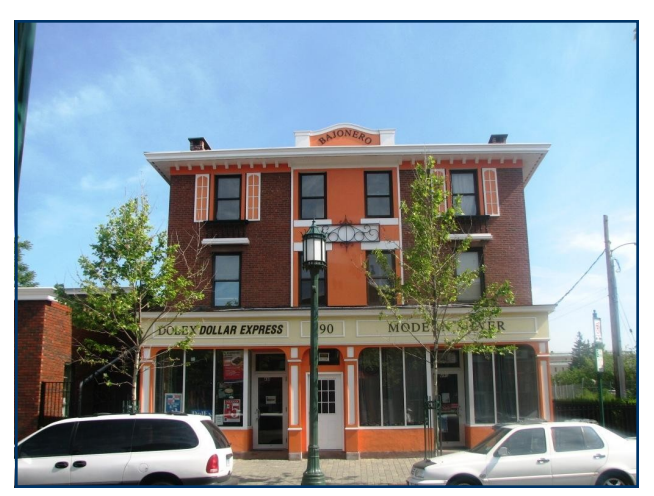
Neighborhood Business Mixed Use-NB