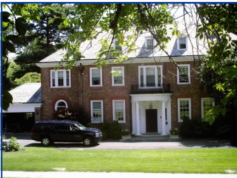
Georgian Revival– Westerly Terrace