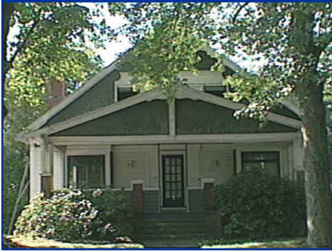
Bungalow (Arts and Crafts) – Fairfield Avenue