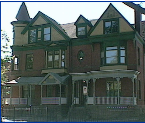
Queen Anne– Wethersfield Avenue