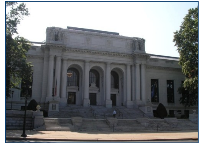
CT State Library & Supreme Court Building

Several iconic structures come to mind when thinking of the Sheldon-Charter Oak and South Green neighborhood including the Colt Armory with its magnificent dome, an the Barnard Brown House at the South Green. Much of the character of this neighborhood arises from the Colt Factory and worker housing. Many of the buildings are made of brick material in the Gothic Revival, and Queen Anne style of architecture.