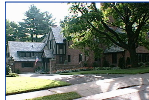
Tudor Revival– Prospect Avenue