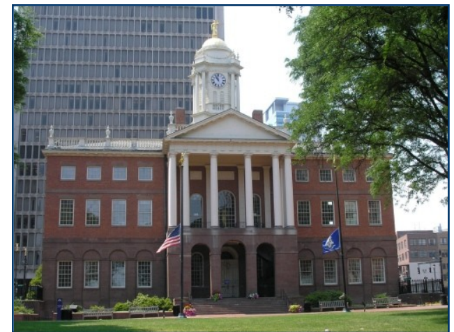
Old State House