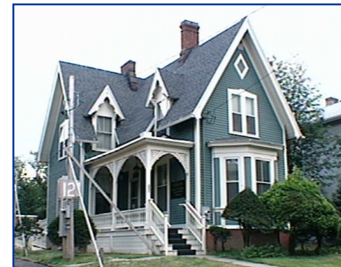
Gothic Revival– Allen Place