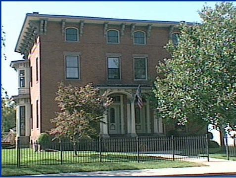
Italianate– Wethersfield Avenue