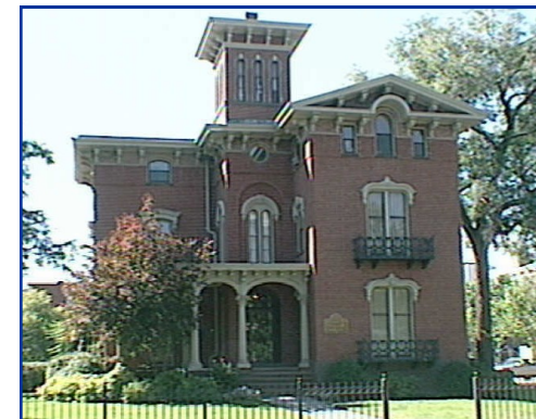
Italian Villa—Wethersfield Avenue