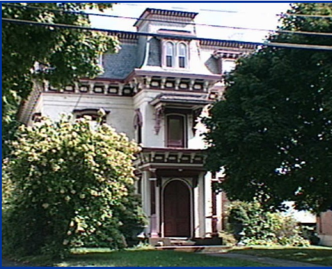
Second Empire– Fairfield Avenue