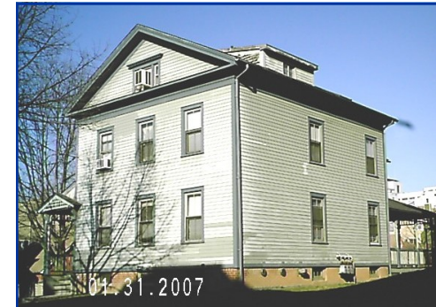
Greek Revival– Alden Street