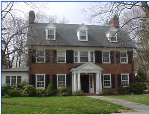
Colonial Revival– Kenyon Street