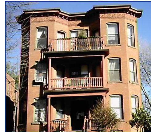
Perfect 6—Park Terrace