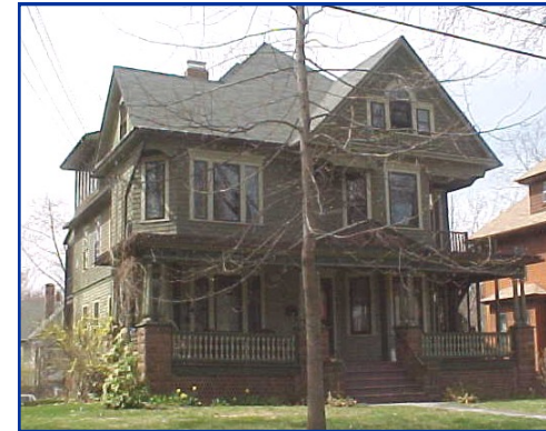
Neo-Classical Revival– Kenyon Street

The Blue Hills neighborhood is mainly comprised of single family, two-family and three-family homes, with a commercial center located on Blue Hills Avenue. The neighborhood has suburban characteristics in that the properties tend to be larger in size than in other areas of the city. Georgian Revivals, Tutor, Dutch Colonial and Colonial style of housing are found in the Blue Hills neighborhood.