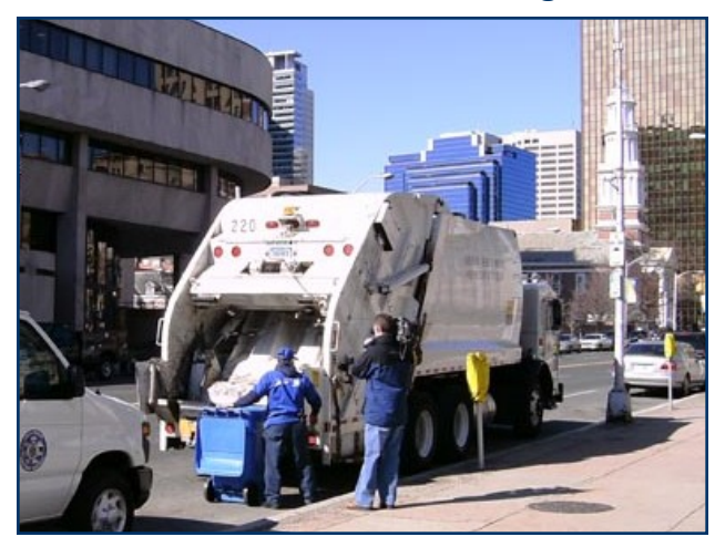
Single-stream recycling Downtown