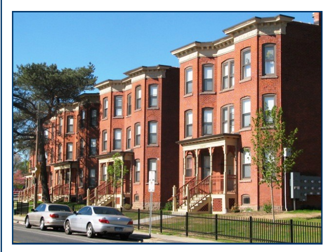
Frog Hollow Perfect 6's