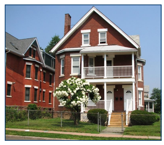
A house located on Allen Place

In order to achieve livable, sustainable neighborhoods, diverse sectors must work together. For example, the quality of schools is connected to the quality of housing, which is affected by the quality of transportation options, etc. Activities in these and other areas can have positive effects on the livability and sustainability of Hartford's neighborhoods.