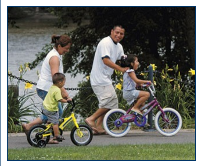
Charter Oak Landing