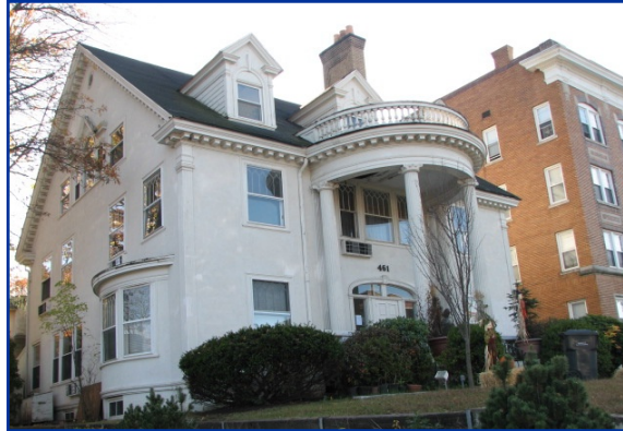
West End Community Center