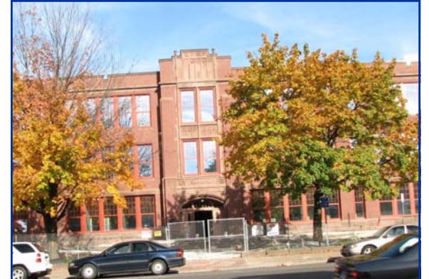
Capital Preparatory Magnet School