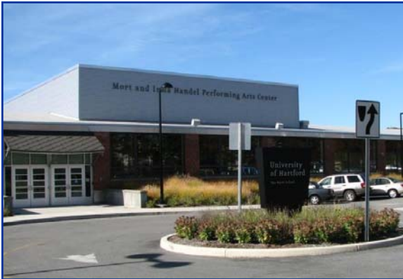
University of Hartford Performing Arts Center