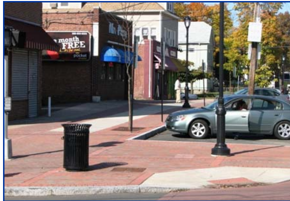
Blue Hills Avenue Streetscape