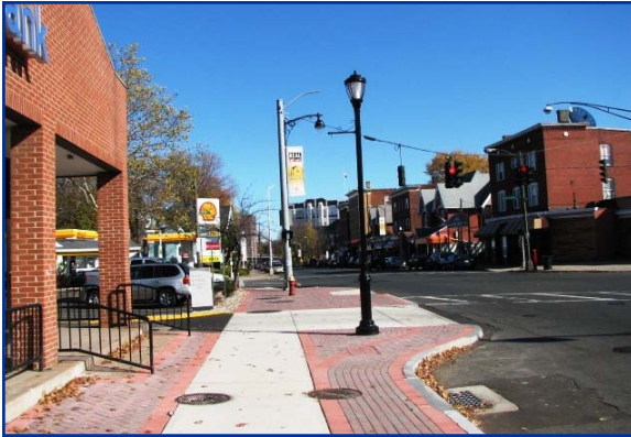
Park Street Streetscape