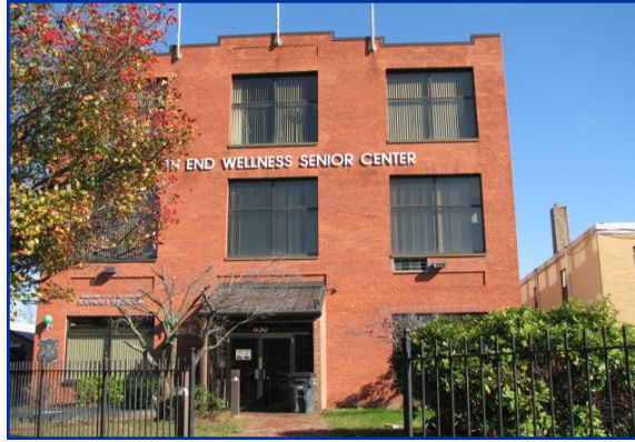
South End Wellness Center