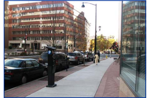
Trumbull Street Streetscape