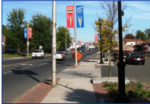
Terry Square Streetscape