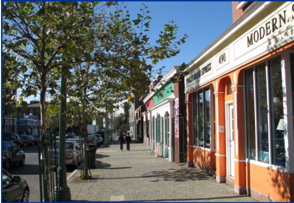
Park Street Streetscape