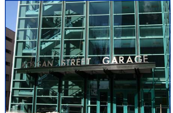
Morgan Street Garage