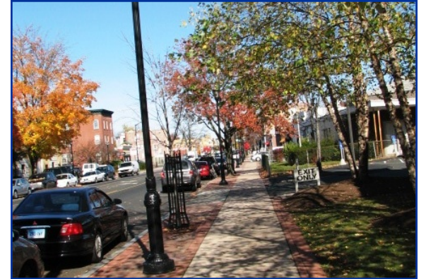
Maple Avenue Streetscape