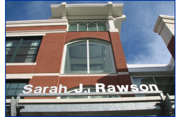
Sarah J. Rawson Elementary School