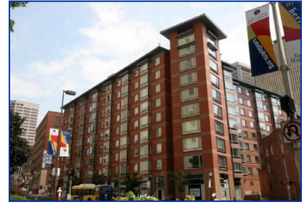
Trumbull On The Park