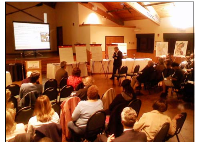
Theme Panel #2, November 16, 2009