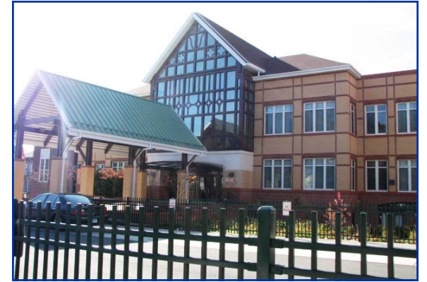
Noah Webster MicroSociety Magnet School