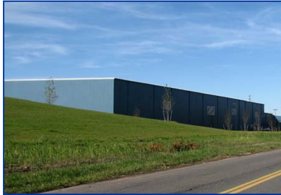
Sims Metal Management