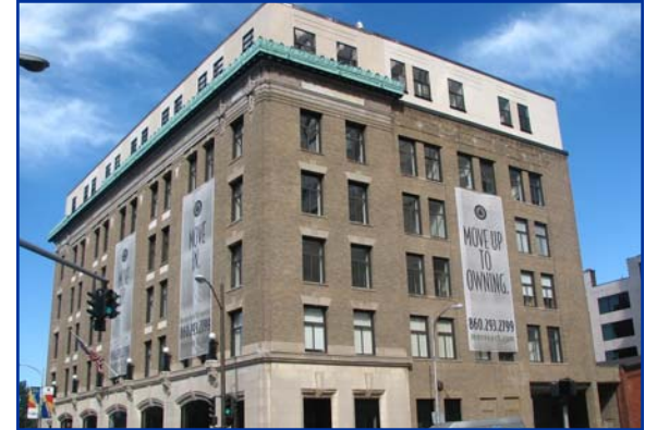
266 Pearl Street