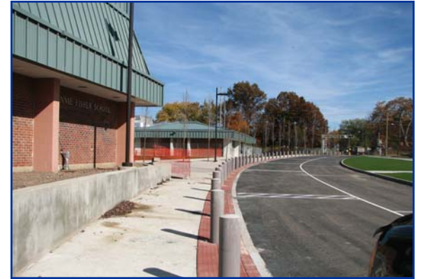
Annie Fisher Elementary School