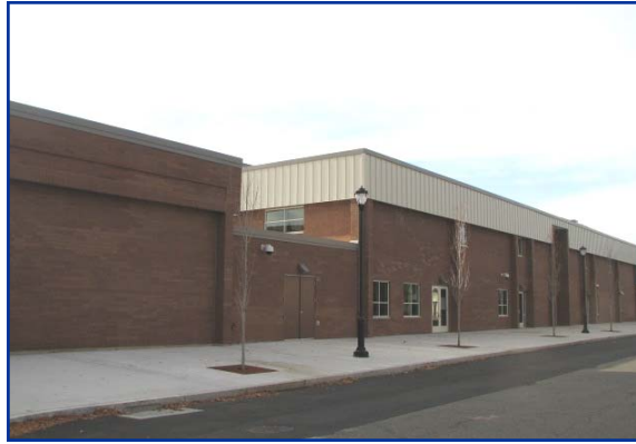
Kinsella Magnet School of the Arts