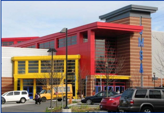
Sports & Medical Science Academy