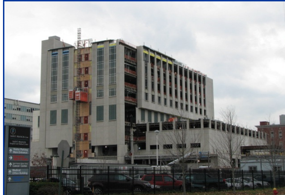
St Francis Hospital Surgical Tower