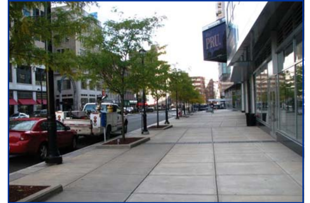
Trumbull Street Streetscape