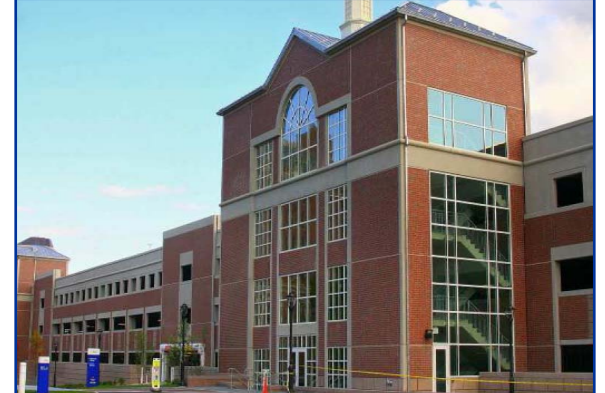
Aetna Expansion- Sigourney Street Garage