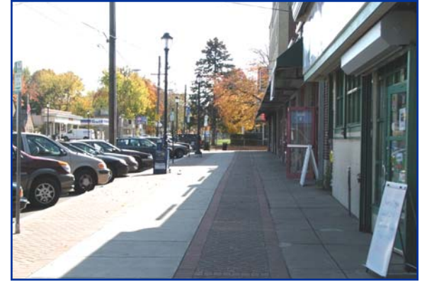
Blue Hills Avenue Streetscape