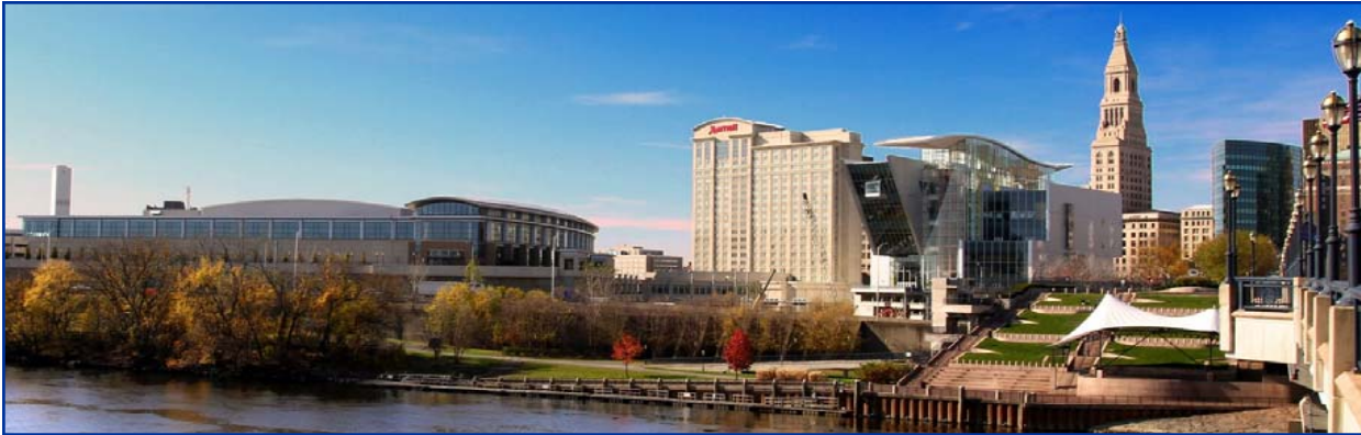
Convention Center, Marriott Hotel, Connecticut Science Center, Waterfront