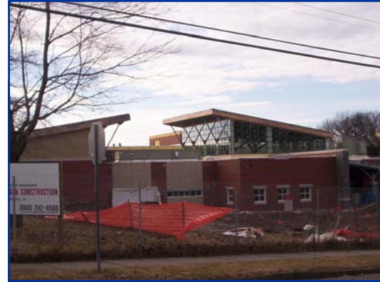
Mary Hooker Environmental Studies Elementary