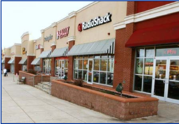
Charter Oak Market Place