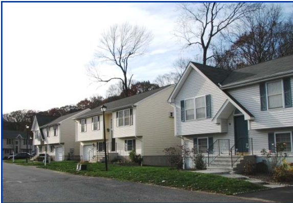
St. Monica's Housing