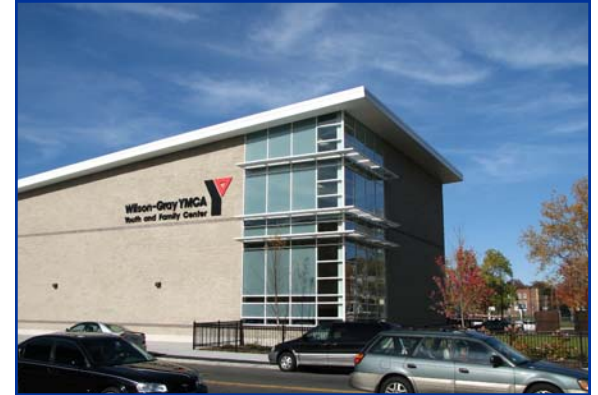
Albany Avenue YMCA