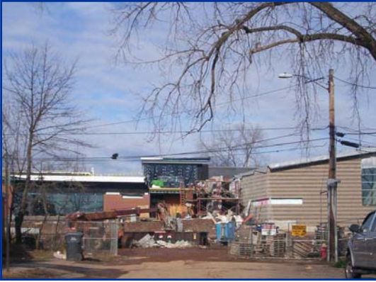
Parker Memorial Center