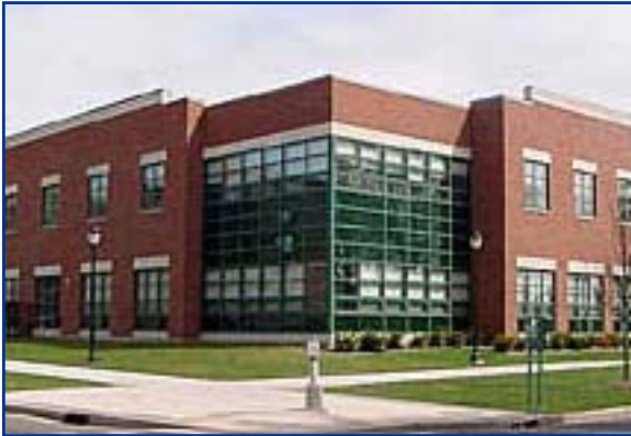
Hartford Magnet Middle School– Learning Corridor