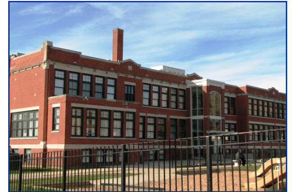
Sarah J. Rawson Elementary School