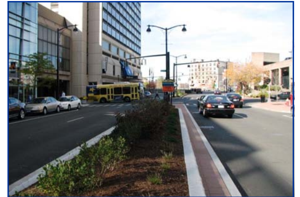
Trumbull Street Streetscape