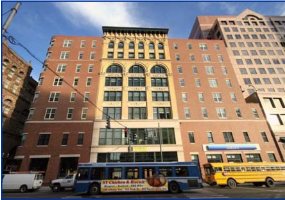
The Lofts at Temple Street