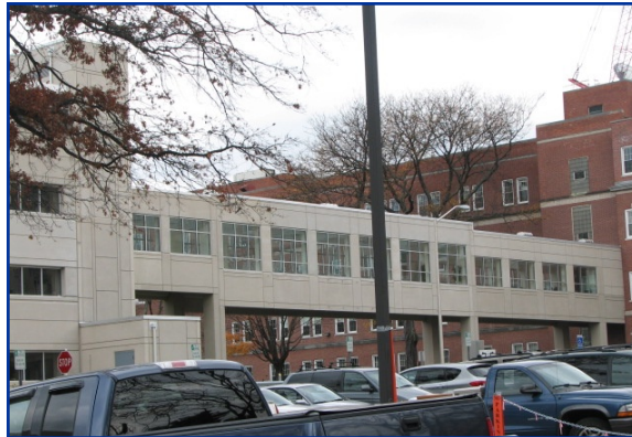
St Francis Hospital Expansion