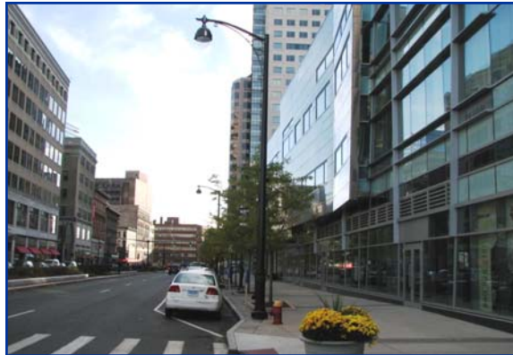
Trumbull Street Streetscape