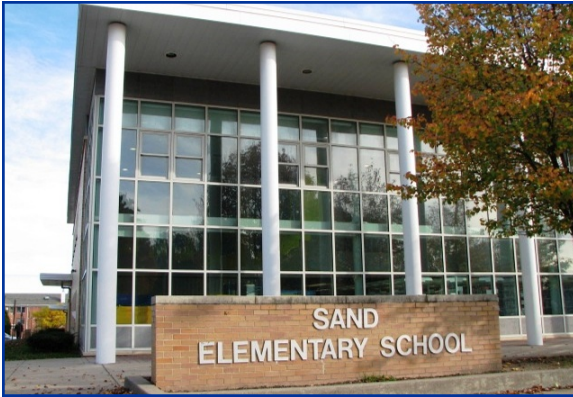
SAND Elementary School