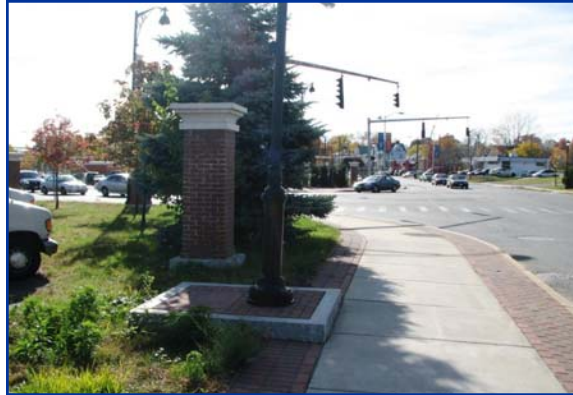
Terry Square Streetscape