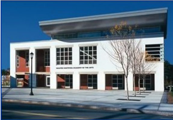
GH Academy of the Arts– Learning Corridor