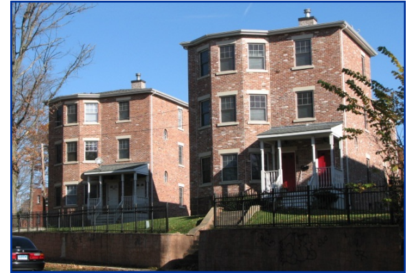
Park Terrace Housing