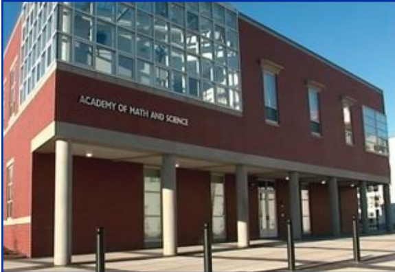
GH Academy of Math & Science– Learning Corridor