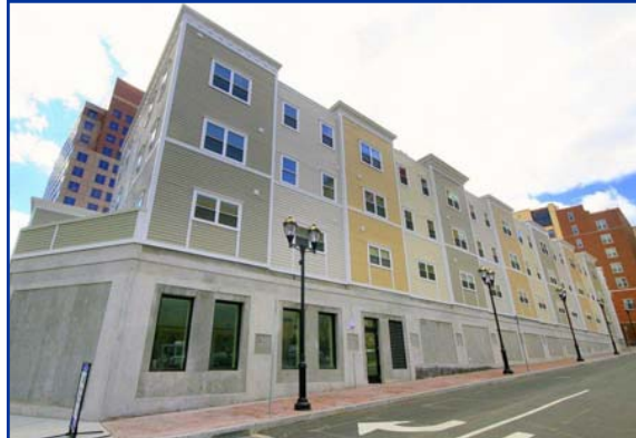
18 Temple Street