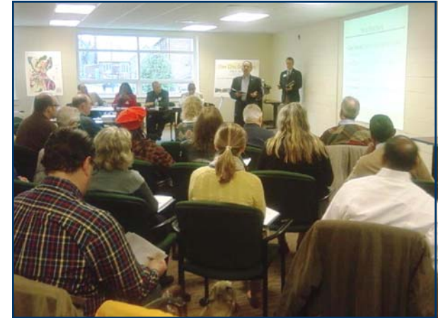
Theme Panel #1, November 14, 2009