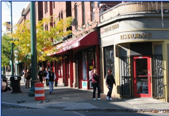
Park Street Streetscape