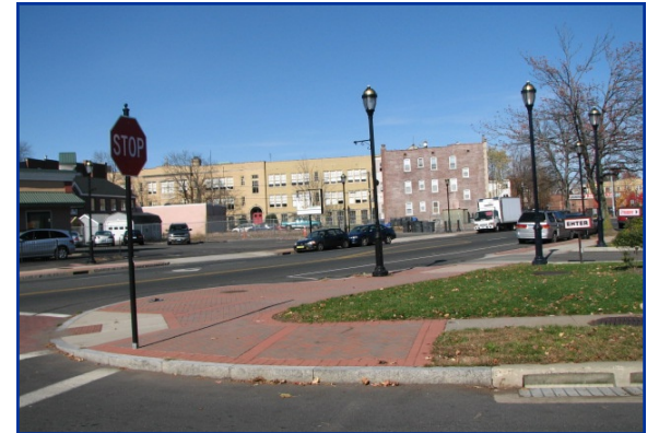
Maple Avenue Streetscape