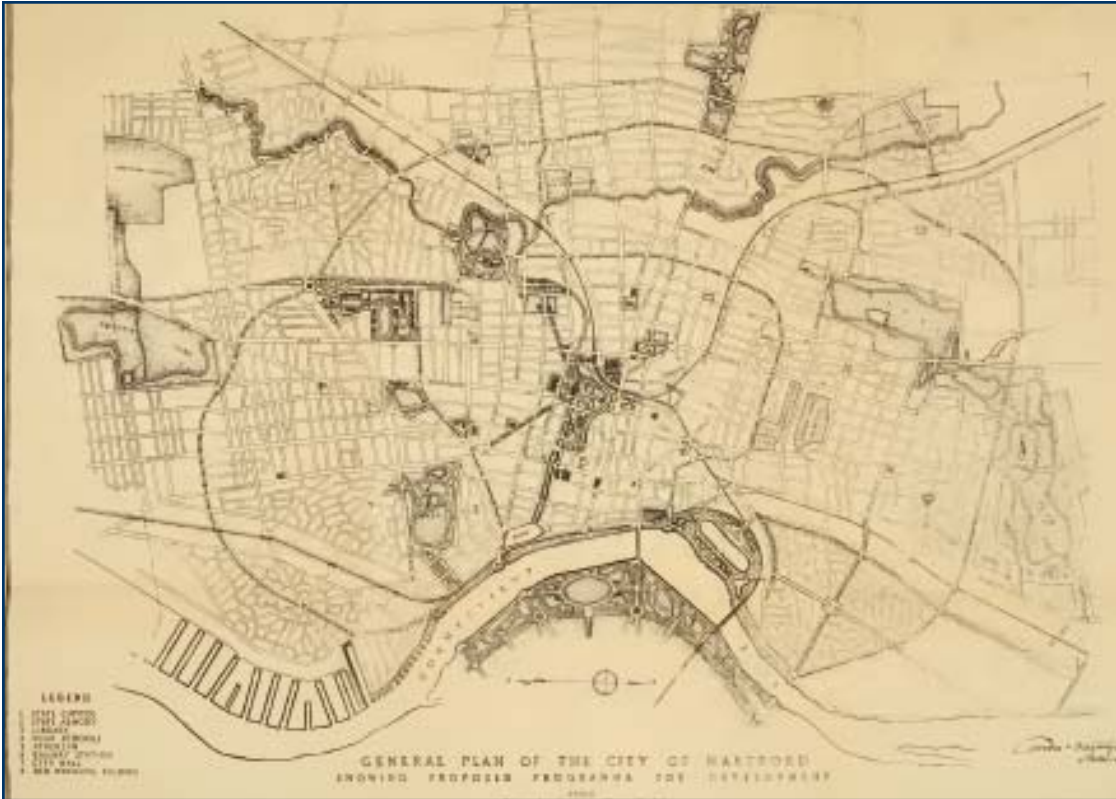
General Plan of the City of Hartford, 1912

“As a matter of fact a city, in the light of modern civilization and modern science and with the help of modern statistics, must be considered as a great machine having a most intricate organism and a most complex function to perform, and it must be so well planned and put together and run, that as an engine it shall produce the maximum of efficiency in every direction with the least expense and the least friction.”