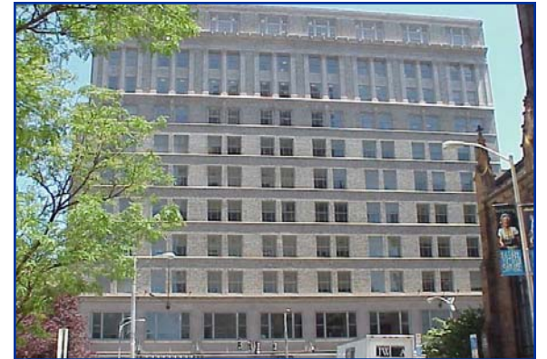
Capital Community College