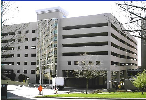
Flower Street Garage