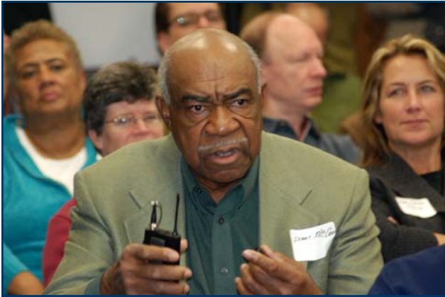
Theme Panel #3, November 21, 2009

sion of the land use map to a GIS format which began the process of assessing existing uses city-wide. At the same time Neighborhood Revitalization Zone (NRZ) Committees began updating their strategic plans. Capital Budget, and State and Regional Plans were reviewed and considered for integration into the generalized land use plan, goals, and implementation strategies. The Planning Division and the Redevelopment Agency also prepared three (3) redevelopment plans at this time focusing on three key areas. The City of Hartford and the MetroHartford Alliance collaborated on the Hartford 2010 process as well as the Urban Land Institute study of North and West Downtown.