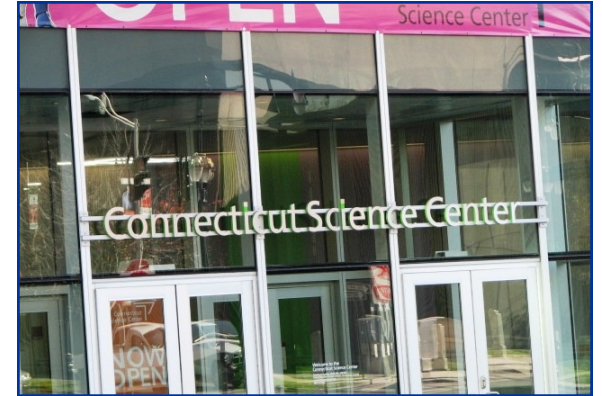
Connecticut Science Center