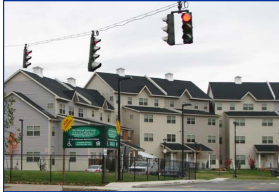
1450 Main Street