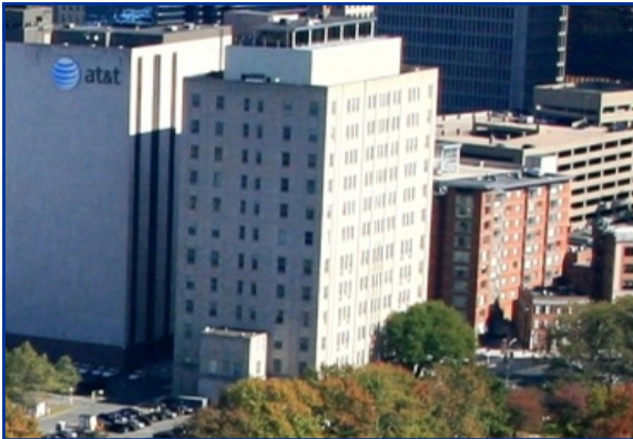
55 Trumbull Street