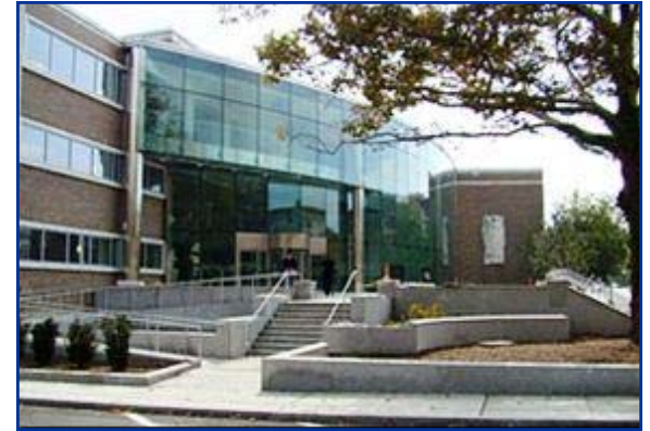
Main Branch of the Hartford Public Library