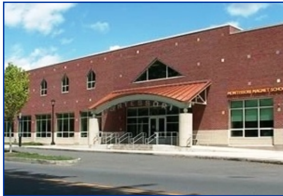
Montessori Magnet School– Learning Corridor