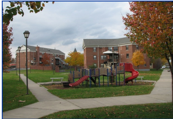
Mary Shepard Housing